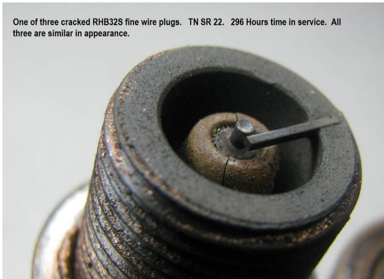
One of three cracked RHB32S fine wire plugs. TN SR 22. 296 Hours time in service. All three are similar in appearance.

Figure 2 (above) is an example of another cracked RHB32S fine wire plug and associated damage to the piston from preignition. The preignition on cylinder # 5 is clearly documented in the downloaded engine data. See Figure 4.